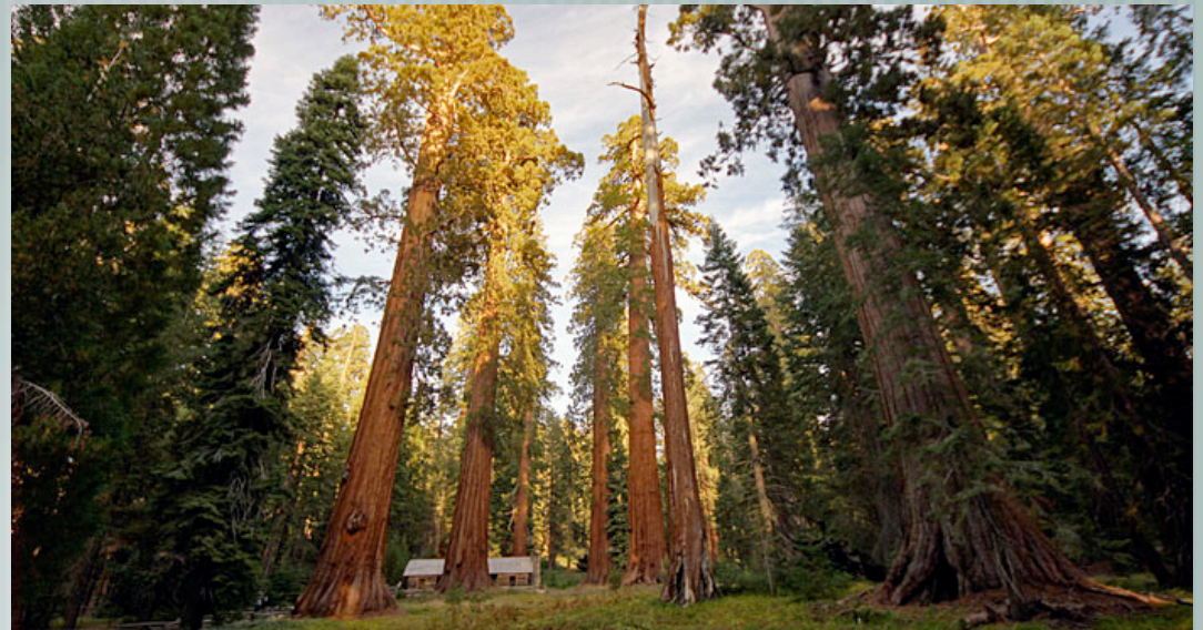
Giant Sequoia Trees